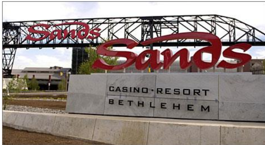
Mike Mergen, Bloomberg News, USA Today , 5/27/09

Office: 308 Comenius Hall Office hours: MW 11:30-1; Thurs. 11:30-12:30; and by appointment