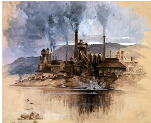
Bethlehem Steel works, May 1881, Watercolor by Joseph Pennell