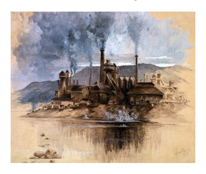
Bethlehem Steel works, May 1881, Watercolor by Joseph Pennell