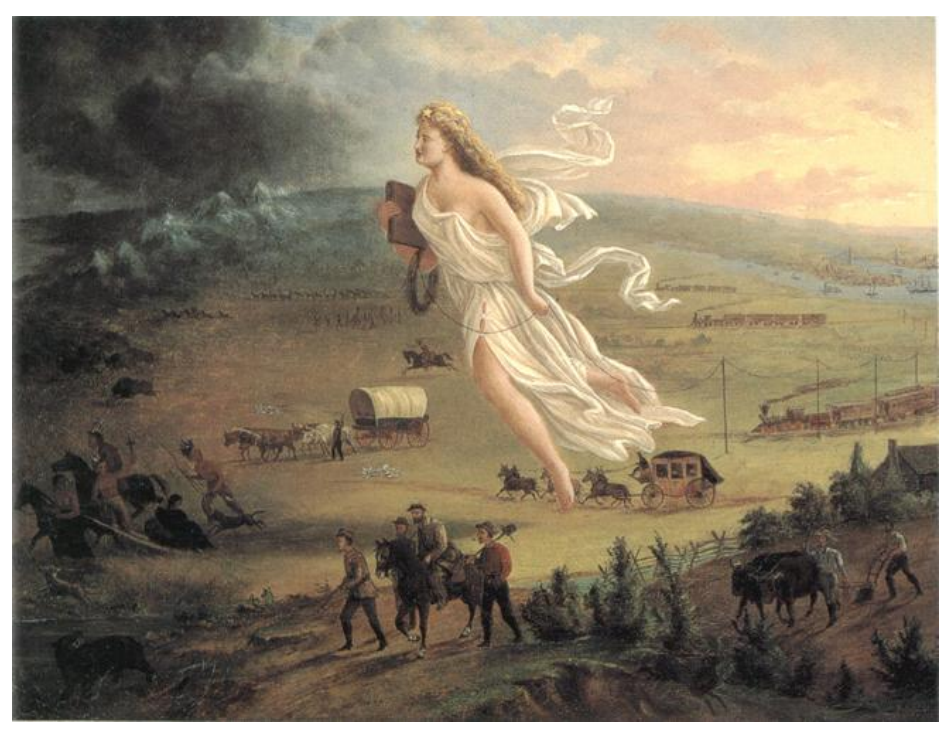
HIST 113B - THE UNITED STATES TO 1877 SPRING 2014