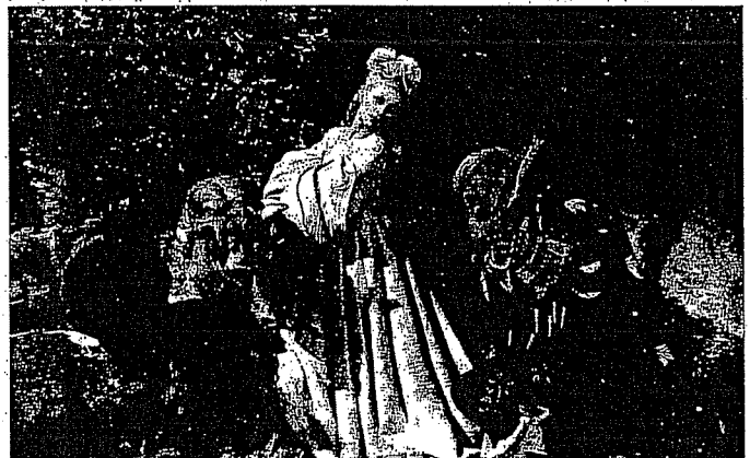
La Belle et la Bête

Course Academic Honor Policy: When preparing for graded assessments you are prohibited from using related work done by other students. Use of electronic translation services for anything other than single word inquiries is also prohibited. Both of these actions may be considered plagiarism. If you are ever unsure about how you are using an electronic source, you should discuss the situation with the professor. You may consult the Student Handbook , pages 51-56 for a full description of Moravian's "Academic Honesty Policy".