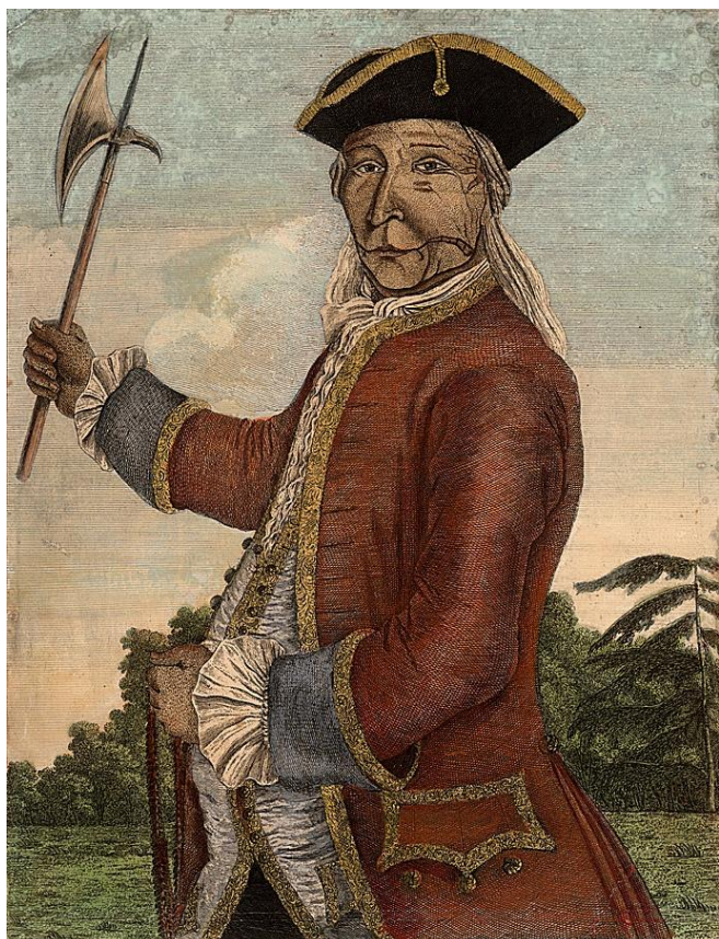
The brave old Hendrick, the great Sachem or Chief of the Mohawk Indians, one of the Six Nations now in Alliance with, & Subject to the King of Great Britain. Sold by Edz. Baskerville opposite Bishops Lane in Cornhill.